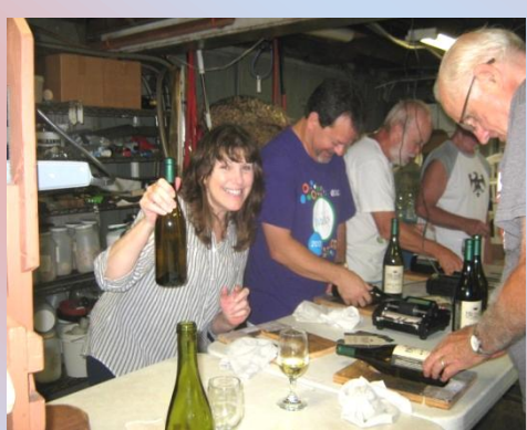
A lot of Work and a lot of Fun

Have a look at our website ~ www.henkewine.com ~